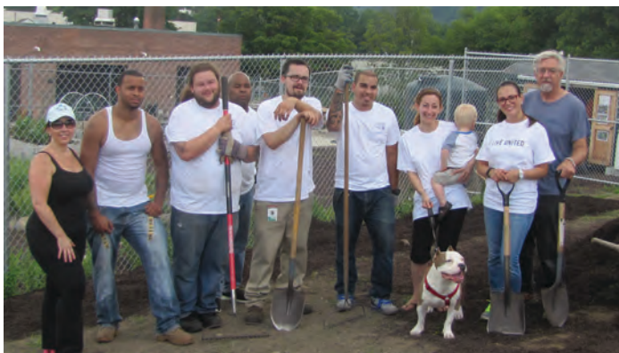
June 2015 Day of Action volunteers at the Newburgh Armory Unity Center

United, we can change what we see in our world.