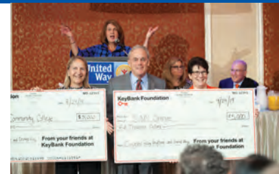
Community Breakfast