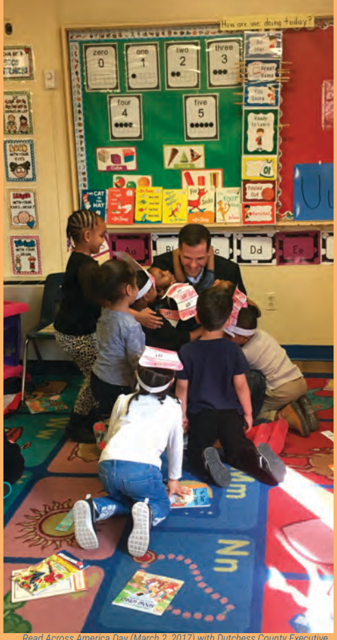
Read Across America Day (March 2, 2017) with Dutchess County Executive Marcus Molinaro reading to students at Catharine Street Community Center